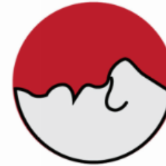
Slow or no breathing