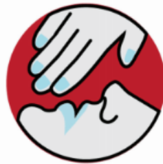
Blue lips or nails