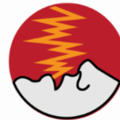
Gurgling or snoring