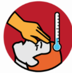
Cold & clammy skin