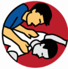
Won't wake up